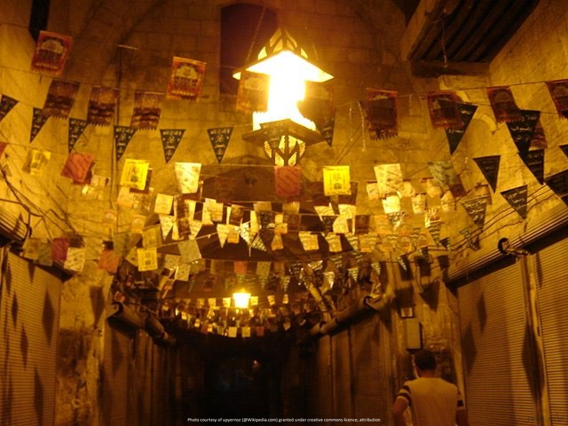
Photo courtesy of upyerno (@Wikipedia.com) granted under creative commons licence; attribution